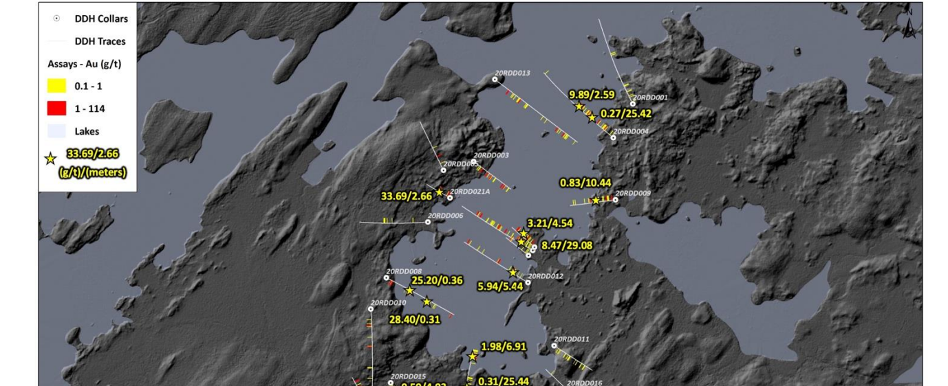
Figure 1. Plan map of drill results

magnetic survey consisting of 373 line kilometers along with a regional till sampling program consisting of 963 B-horizon soils were completed along trend of Regnault to cover the Regnault South property, which was acquired by Kenorland in March 2020.