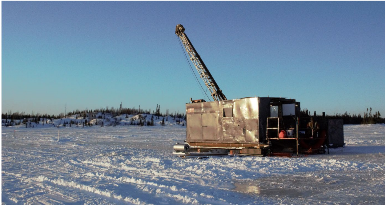
Figure 2. Drilling now underway at Regnault

Zach Flood, CEO of Kenorland states, "We're delighted to have the drills turning again on this incredible discovery. In mineral exploration, the odds of finding a completely new, and significant gold system are extremely rare. I believe we've succeeded in that and the objective now is to expand the footprint, and define the limits and continuity of mineralization."